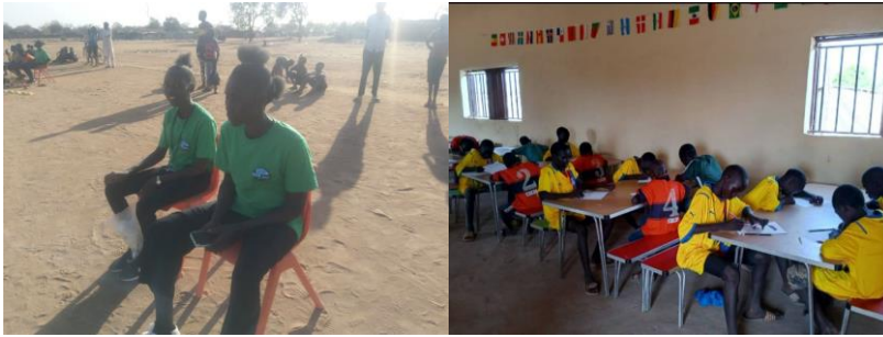
Virtual teaching and joint activities with children via Zoom.